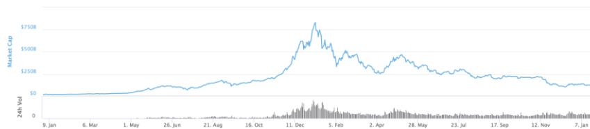
Figure Three: Combined market capitalization of all cryptocurrencies between January 2017 and January 2019. 95

followed by rapid price contraction. In the last two years, the market capitalization of all cryptocurrencies has fluctuated from a few billion to almost a trillion dollars and then back down to just above one hundred billion. 92 Furthermore, there is evidence that these price fluctuations have not been in line with the cryptocurrency economic fundamentals, such as supply and demand, but rather by exuberant market speculation. 93 If cryptocurrencies do result in an economic bubble, it will lead to serious economic consequences for localities in which cryptocurrency miners have become a major part of the local economy. 94